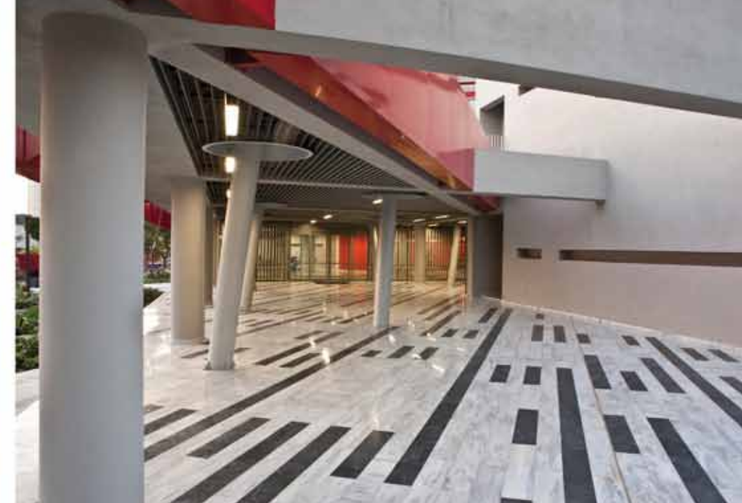
AUTH Research Dissemination Center